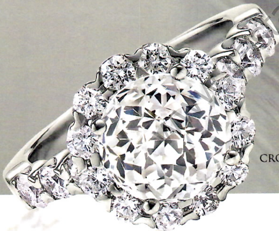
CROWN BRILLIANT® COLLECTION